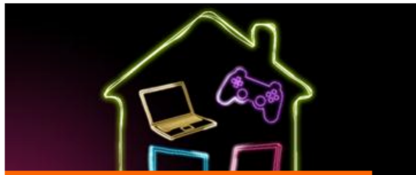
How to set up the parental controls offered by TalkTalk