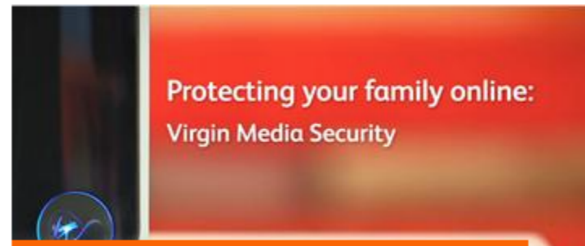
How to set up the parental controls offered by Virgin Media