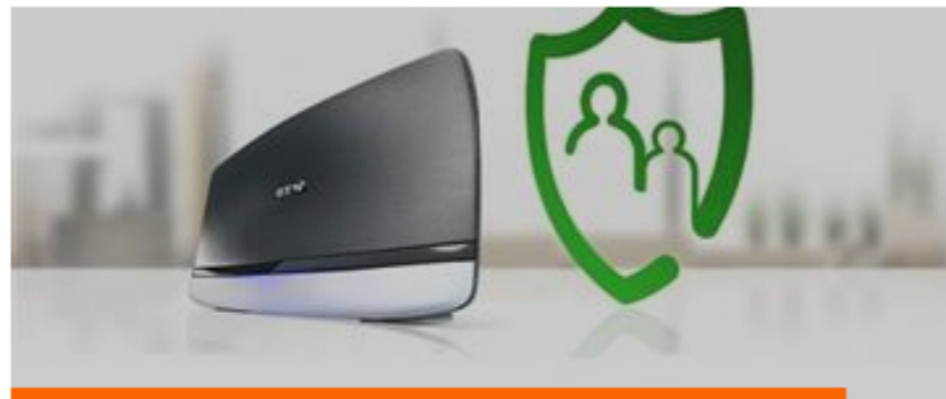
How to set up the parental controls offered by BT