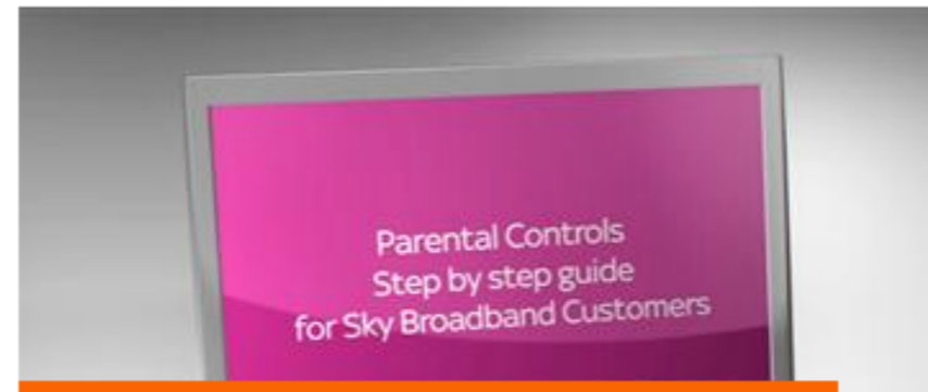
How to set up the parental controls offered by Sky